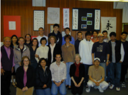
Chinese graduating class