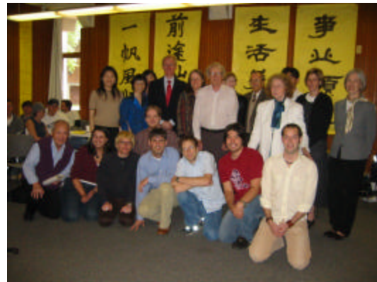
East Asian Studies graduating class