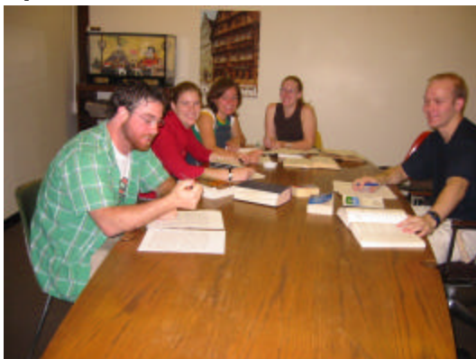
Students in the tutor room